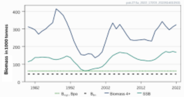
Figure 2. Saithe in Division 5.a. Summary of the stock assessment. Harvest rates are calculated based on biomass age 4+. All biomass reference points refer to SSB levels. For this stock, MGT B_{trigger} = MSY B_{trigger} = B_{pa} . HR_{MSY} = HR_{mgt} .

Therefore, the species is considered, in its most recent stock assessment, to have a biomass above the limit reference point and it PASSES clause C1.2.