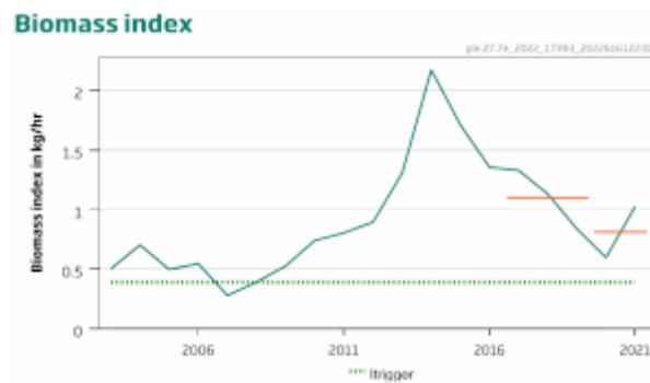
Figure 3: Plaice in Division 7.e. Summary of the stock assessment. The horizontal orange lines indicate the average of the biomass index for 2017 to 2019 and for 2020 to 2021.