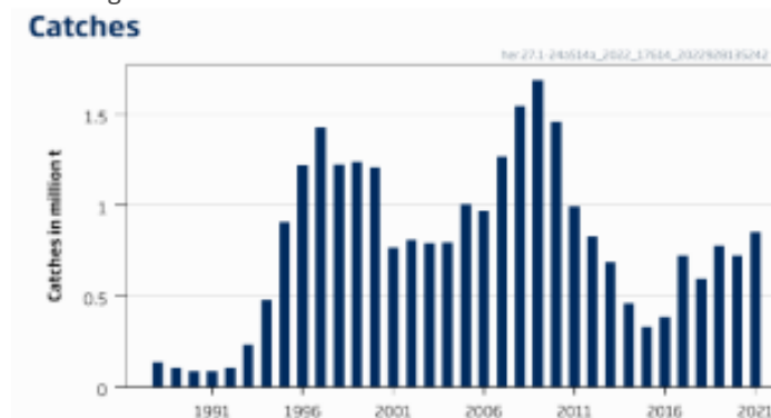
Figure 1. Long-term catches for herring in ICES subareas 1, 2, and 5, and divisions 4.a and 14.a.

Catches for this stock can be found in Figure 1 below: