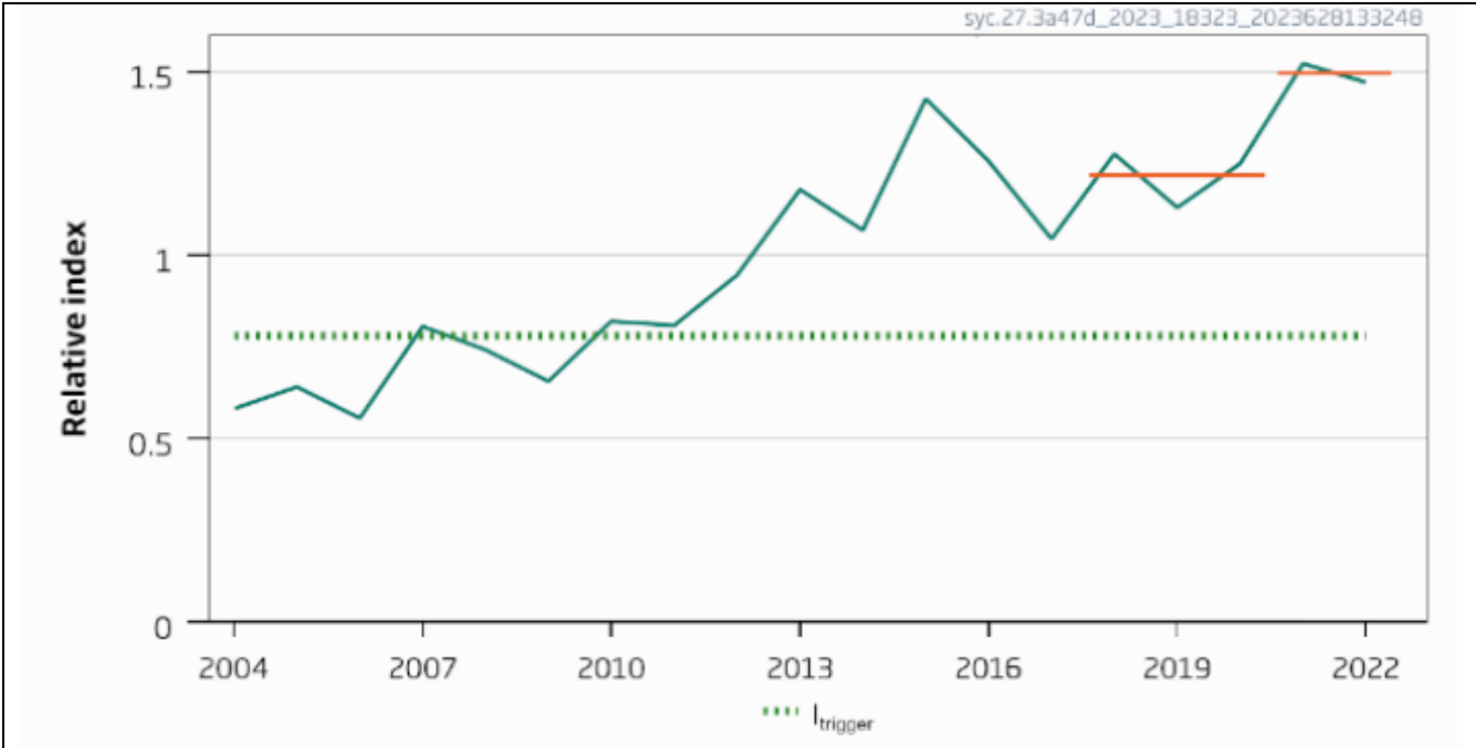
Stock Size Indicator relative to current I_{trigger} reference point, lesser-spotted dogfish in Subarea 4 and Divisions 3a and 7d (ICES 2023a)